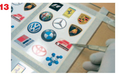
Repair decals that have uncovered areas by dragging the resin gently outwards with a spatula or scalpel.