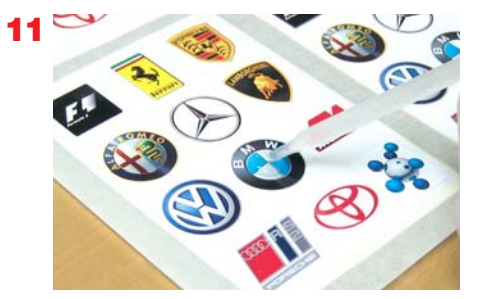
Dome your decals by gently squeezing resin onto the surface. Be careful not to apply too much or too little. (This will come with practise) The resin will automatically move toward the silicon coated backing paper. Don't worry if it doesn't move all the way to the edge of the decal - you'll have time to correct this later.