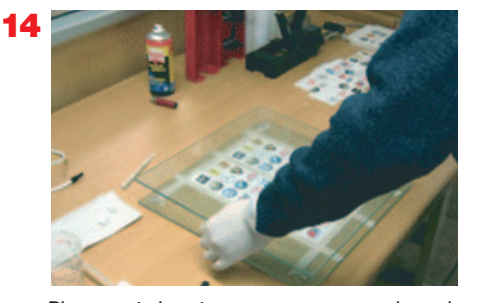
Place next glass tray on spacers over domed decals to prevent dust etc. from affecting vour decals.