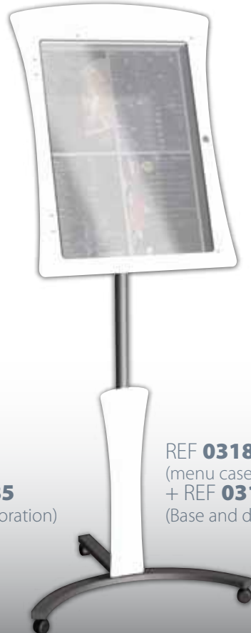
REF 03182 (menu case) + REF 03184 (Base and decoration)

Menu Case - 4 x A4 Pages Suitable for internal or external use