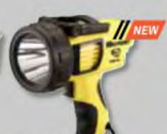
WAYPOINT® RECHARGEABLE pg. 57