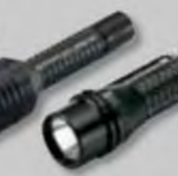
SUPER TAC® X pg. 78