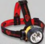
TRIDENT HP® pg. 118