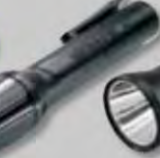
3C PROPOLYMER® LUX pg. 75