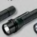
TL-2® LED pg. 80