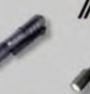
STYLUS PRO REACH™ pg. 109