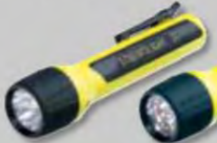
3C PROPOLYMER® XENON pg. 74