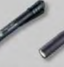
MICROSTREAM® pg. 108