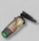
CAMO CLIPMATE® pg. 106