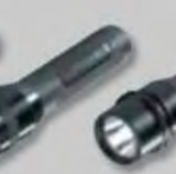
SCORPION® X pg. 82