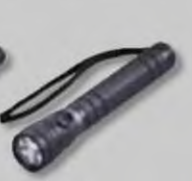
TWIN-TASK® 3C LED pg. 122