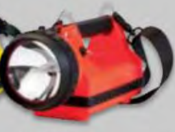
FIREBOX® pg. 55