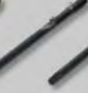
STYLUS® UV pg. 111