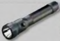
POLYSTINGER DS® LED pg. 29