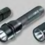
TL-2® X pg. 81