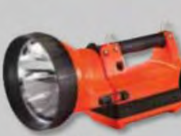
HID LITEBOX® pg. 53