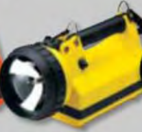
LITEBOX® pg. 54