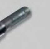
SCORPION® LED pg. 82