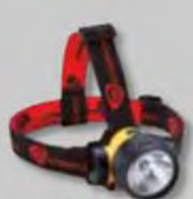
TRIDENT® pg. 119