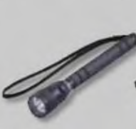
TWIN-TASK® 3AA LED pg. 122