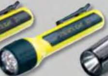
3C PROPOLYMER® LED pg. 74