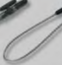
STYLUS REACH® 18 pg. 112