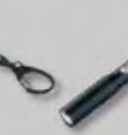
STYLUS PRO® pg. 108