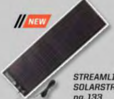
STREAMLIGHT SOLARSTREAM™ pg. 133