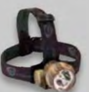
BUCKMASTERS® CAMO TRIDENT HP® pg. 119