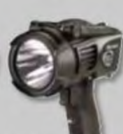
WAYPOINT® pg. 56