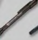
STYLUS® pg. 111