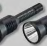
SUPER TAC® pg. 78