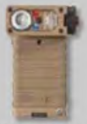
SIDEWINDER® MILITARY pg. 99