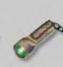
CAMO KEY-MATE® pg. 106