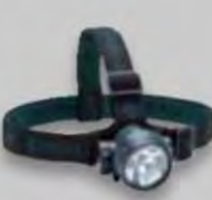
GREEN TRIDENT® pg. 119